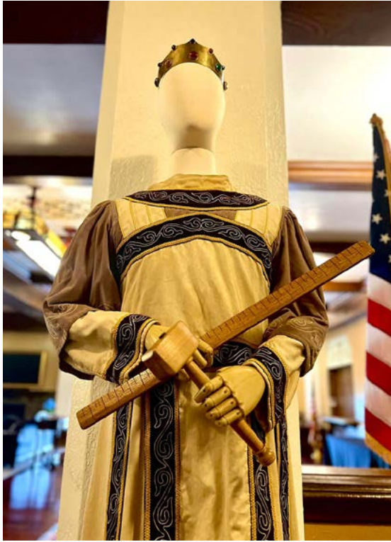
5th Degree, Perfect Master