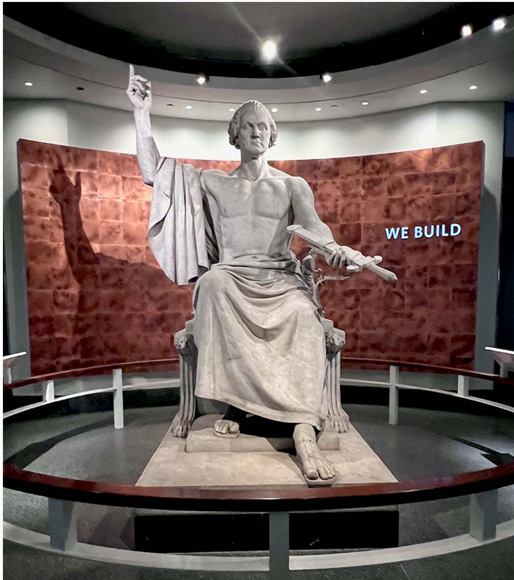
Washington Enthroned: Horatio Greenough's twelve-ton marble statue was commissioned by the United States Congress on July 14, 1832 for the centennial of Washington's birth. It is now on display at the Smithsonian Museum..