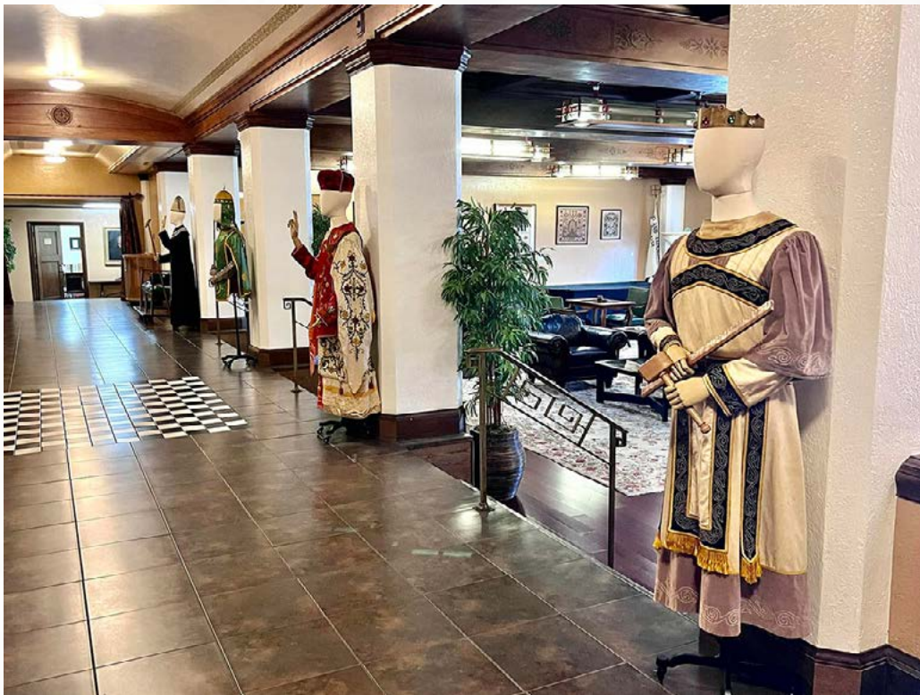
Behold! The line-up of our degree characters!

We would like to fill this space with display cases with your help! If you are interested in being a part of history by saving history, consider donating to the Oakland Scottish Rite Historical Foundation! See https://osrhistoricalfoundation.org/donate/ for more information.