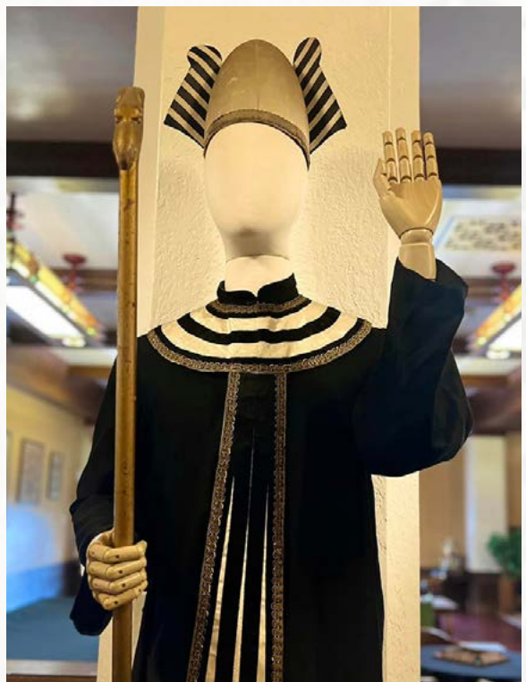
31st Degree, Inspector Inquisitor