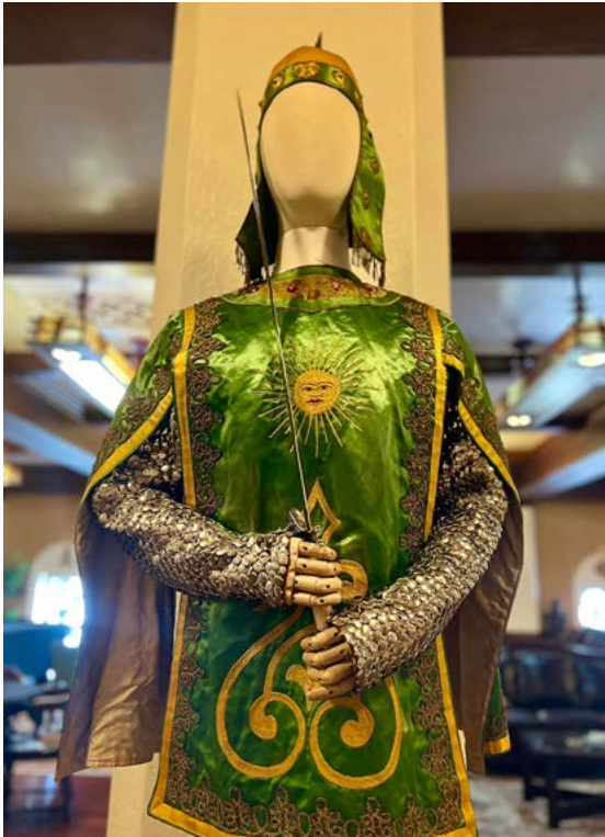
28th Degree, Knight of the Sun or Prince Adept