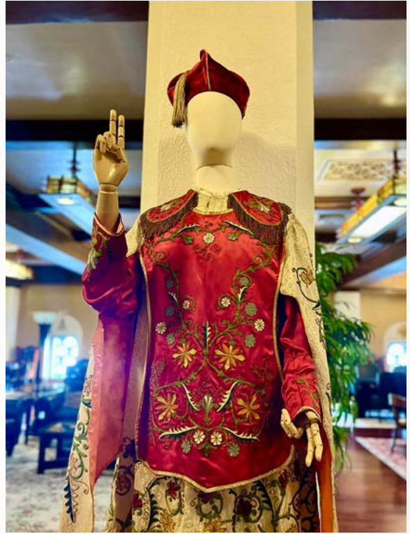
18th Degree, Knight Rose Croix