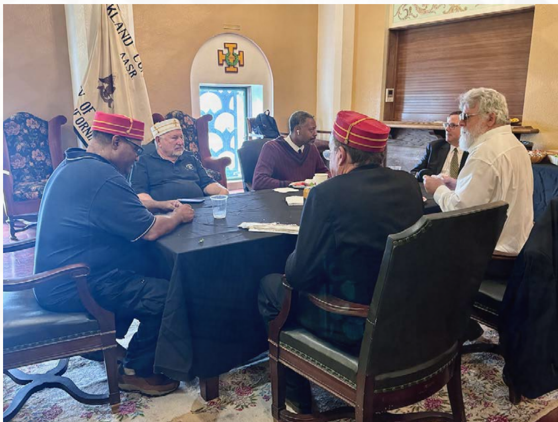
Oakland and Santa Rosa brethren meet at breakfast to discuss the degree production.