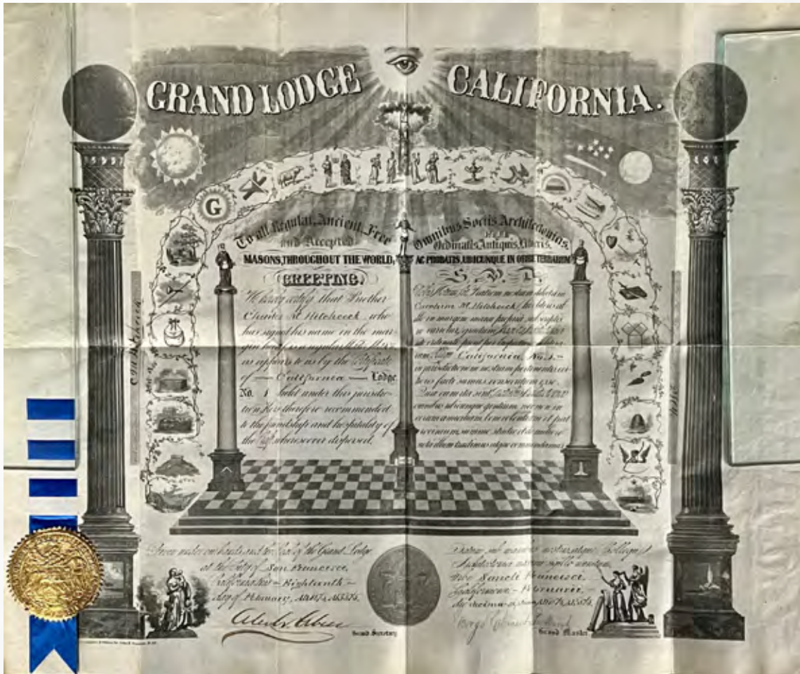
Hitchcock Certificate (obverse)