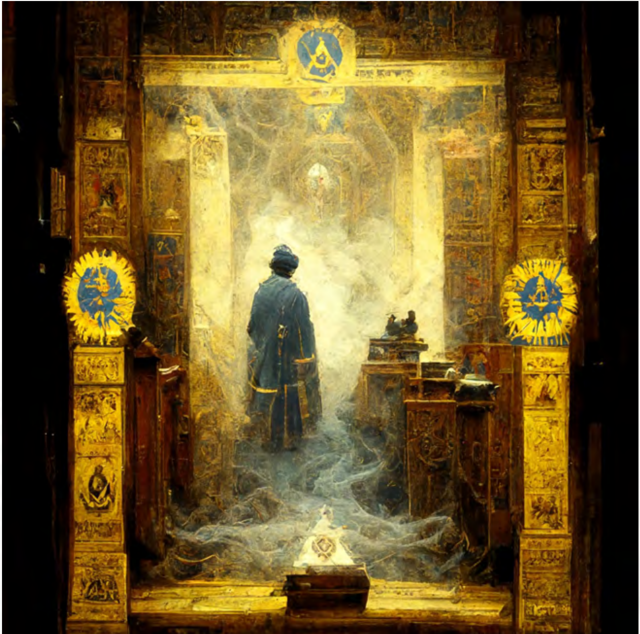
“Masonic Mysteries” interpreted by Midpoint AI. This is an artificial intelligence program designed to produce artworks and photography according to a user’s descriptive commands.