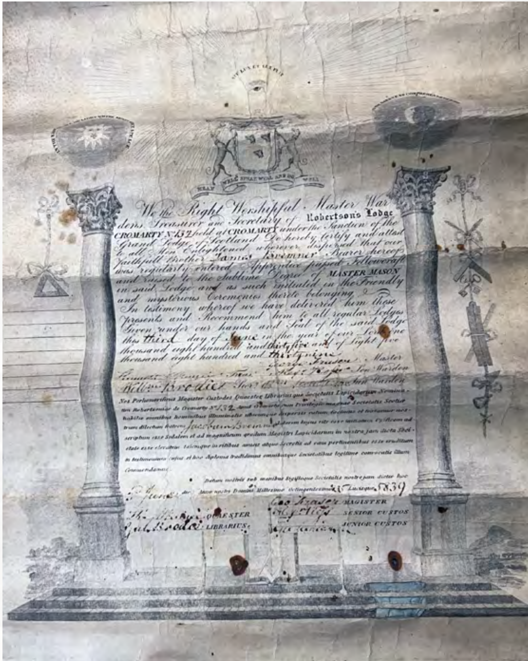
A beautiful Scottish Master Mason's certificate, 1839

This was the question I was asked: How does Oakland Scottish Rite “make good men better”? This question requires serious thought and consideration to answer when it is posed to one of us. So my question to YOU is: how do you and your involvement in Masonry “make good men better”?